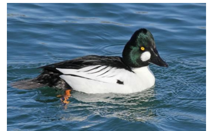
Hooded Merganser, Common Goldeneye