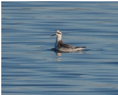
American Pipit, Snow Buntings, Red Phalarope (taken on field trip)