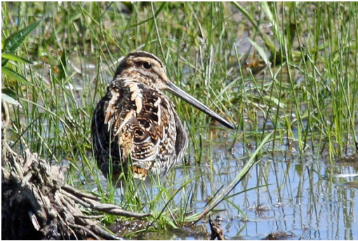
Wilson's Snipe - Joan Tisdale

The weather was cool early (~50°F) with sunny skies and strong winds. It slowly warmed into the 70's as the morning wore on. We worked around the pond at the nature center at Bay City SRA, then along the woods working east until we came to the shoreline area. There were some active sparrows, kinglets and other small passerines. At the shoreline we had some ducks and gulls and were surprised by the flying Wilson's Snipes at the reeds along the shoreline. We worked our way back to the nature center and then headed to Tobico Marsh. In all, 46 species were tallied for the day. Trip leader: Don Burlett.