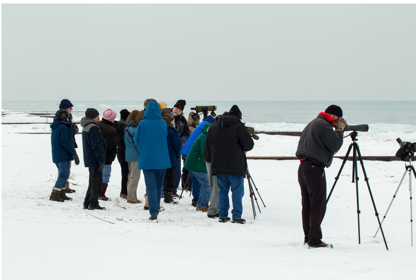
OAS members on last year's St. Clair River field trip