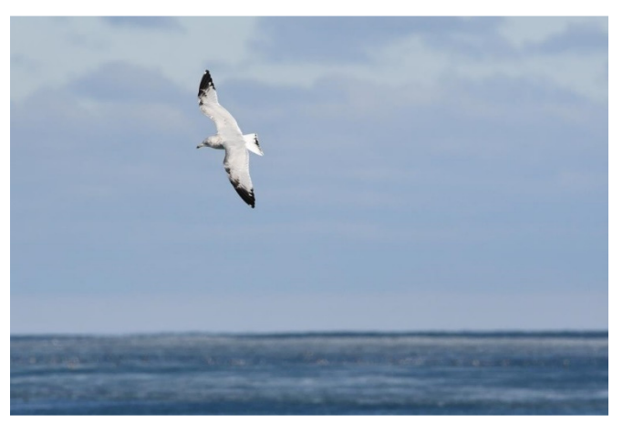
Ring-billed Gull Kayla Niner

It's been a bit of a weird winter with warm temperatures for a long period followed by very cold temperatures. The river was open for the most part and very little ice along the way. The temperature was relatively mild with a solid west wind.