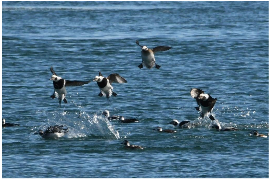
Long-tailed Ducks

We then began our drive along the river, not stopping for the Lake St. Clair as it was completely frozen over. As we moved north, we made stops at the Harsen's Island ferry (nothing there), in Algonac (a few ducks including Long-tailed Ducks and Mallards), Marine City (not much activity but a few Ducks and some Tundra Swans, St. Clair (lots more Long-tailed Ducks along with Common Goldeneye, Redheads and, Hooded Merganser, Bufflehead and others), Marysville (more Long-tailed Ducks) and finally into Port Huron. We stopped at Desmond Landing for gulls (mostly Herring), the USCG boat, Edison Parkway and Lighthouse Park. We did add Red-breasted Merganser along the way but by far the most common ducks were the Long-tailed Ducks in the 1000's.