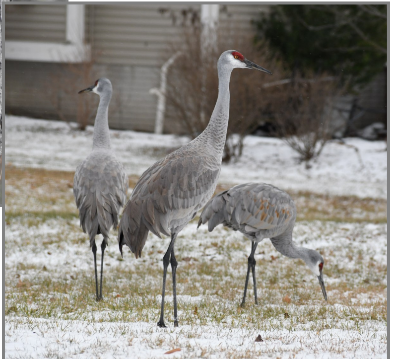
Sandhill Crane, Antigone canadensis