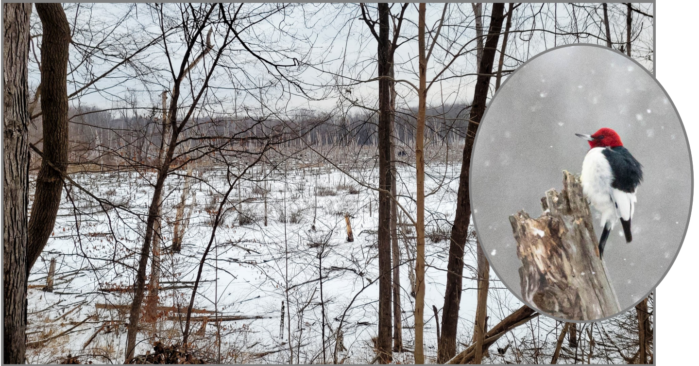
Red-headed Woodpecker, Melanerpes erythrocephalus & suitable habitat at CBC area #4 (Robert Bochenek)