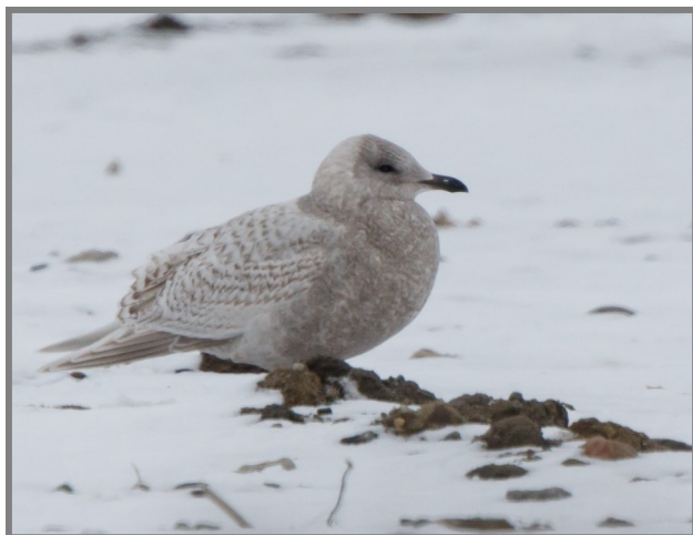
Iceland Gull, Larus glaucooides (Jeff Stacey)