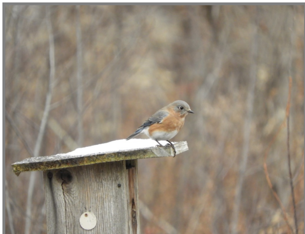
Eastern Bluebird, Sialia sialis (Brian Beauchene)