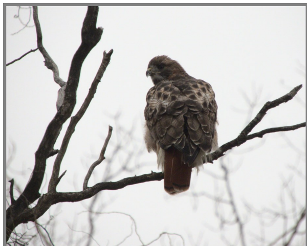
Red-tailed Hawk, Buteo jamaicensis