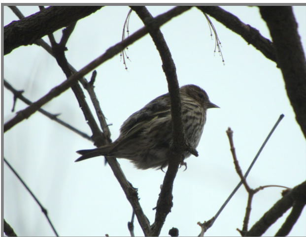
Pine Siskin, Spinus pinus (Brian Beauchene)