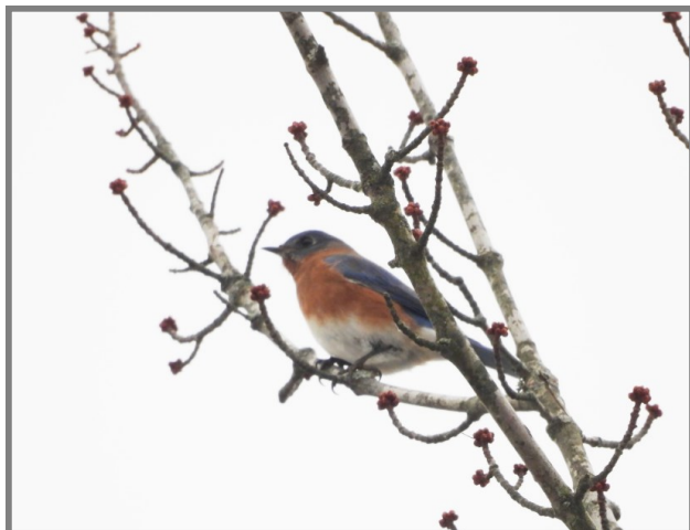
Eastern Bluebird, Sialia sialis (Manny Salas)