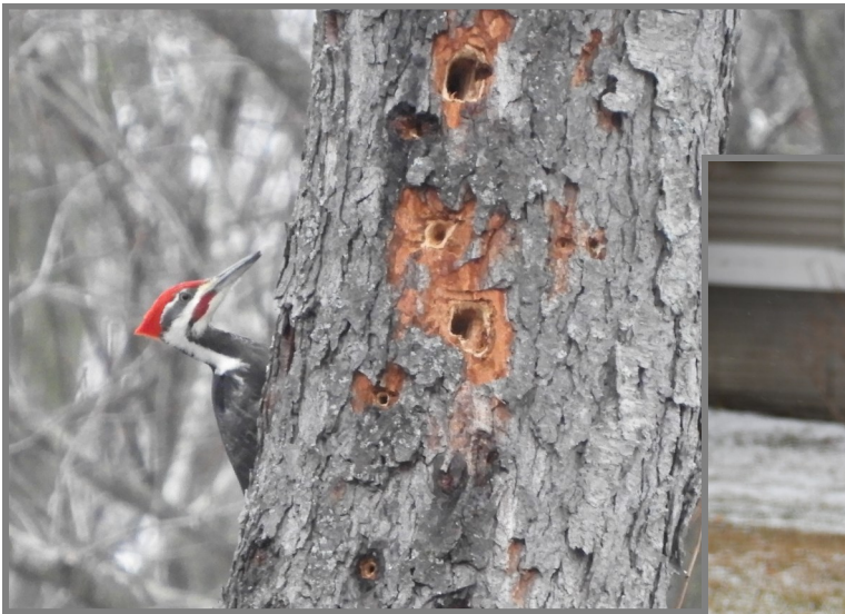
Pileated Woodpecker, Dryocopus pileatus (Brian Beauchene)