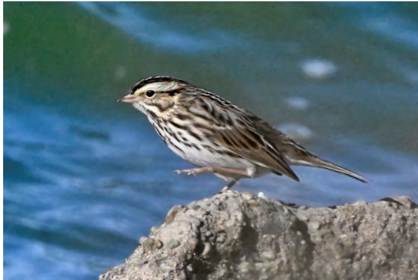
Savannah Sparrow

After finishing the field trip, a group went out for lunch to exchange stories and experiences. It was a nice outing, and we hope to duplicate the success and fun at our next joint field later this month. A list of species seen at each location is provided below.