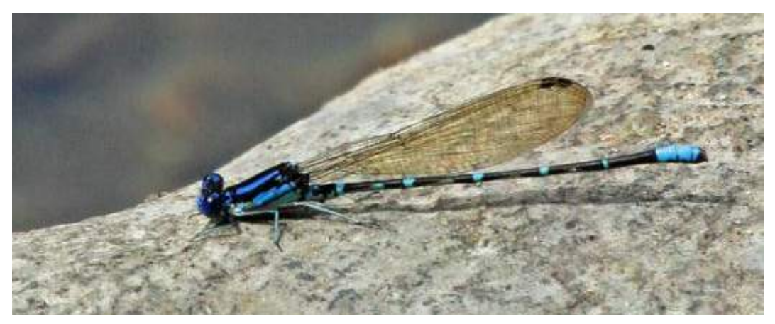
Blue-ringed Dancer damselfly