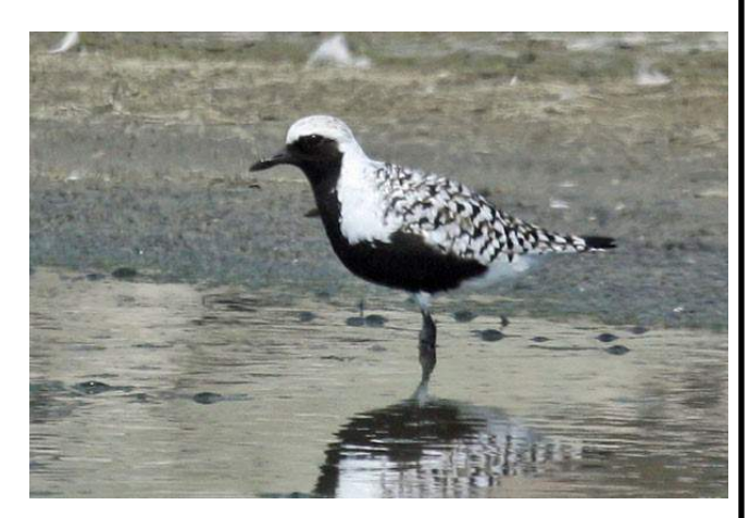
Black-bellied Plover by Joan Tisdale

We also went to Hillman Marsh to check out the shorebirds and got a number of Black-bellied Plovers there amongst a number of other shorebirds. A daily tally of 63 species was the result of some hard work.