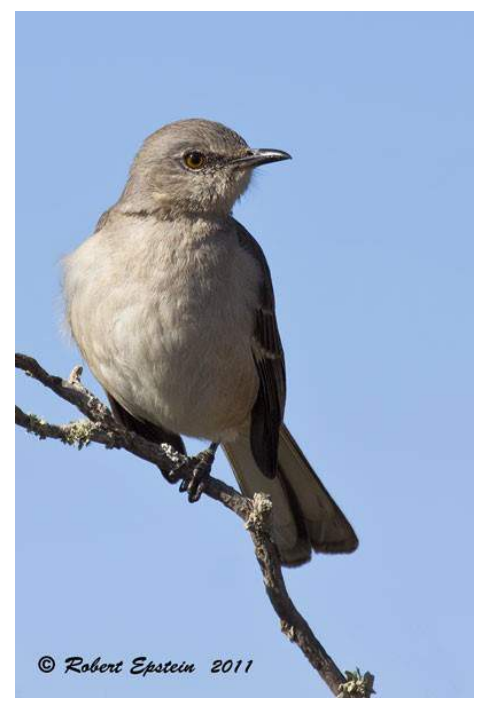
Northern Mockingbird