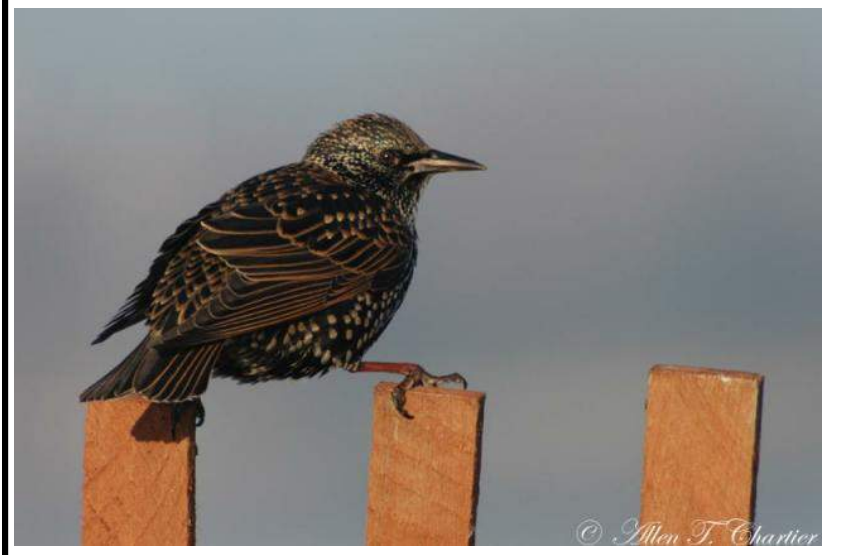
European Starling by Allen Chartier

Thrushes (family Turdidae) are also well known for their beautiful, varied and complex songs, and a few species are known for their mimicry skills. Comprising more than 300 species in four subfamilies,