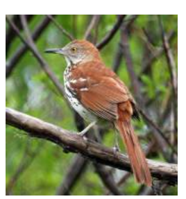
Brown Thrasher by Joan Tisdale

On Saturday, we headed to Berrien County because it is a popular location for early spring migrants. We started at the beach in New Buffalo and there were no surprises waiting for us this time. But we did see Common Loon, Pied-billed and Horned Grebes and some gulls and ducks. We next headed to Buffalo Road, a sprawling area of farm fields. Here we encountered a large number of Brewer's Blackbirds and breeding-plumaged Lapland Longspurs. Unfortunately, no Smith's Longspurs were present. We then went to the Galien River Floodplain. Here, we were rewarded by a few warblers (Yellow-rumped, Yellow-throated, Pine, and Louisiana Waterthrush). We also got a few raptors (Red-shouldered, Red-tailed, Cooper's, and Broad-winged Hawks, and American Kestrel). Also, we got a number of looks at Brown Thrashers which were plentiful.