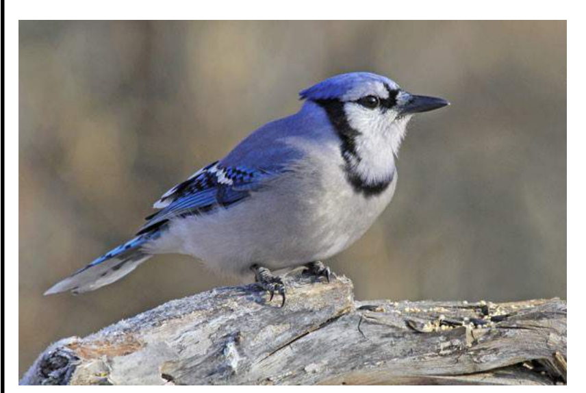
Blue Jay

But evolution by sexual selection on expanding vocal repertoires is not the only explanation for mimicry. We also know that parrots (family Psittacidae) can be trained to imitate human speech, but in the wild they are almost never heard to use mimicry. And jays and crows (family Corvidae) also use mim-